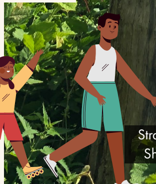
Strawberries at Shafford Meadows, Hedge End