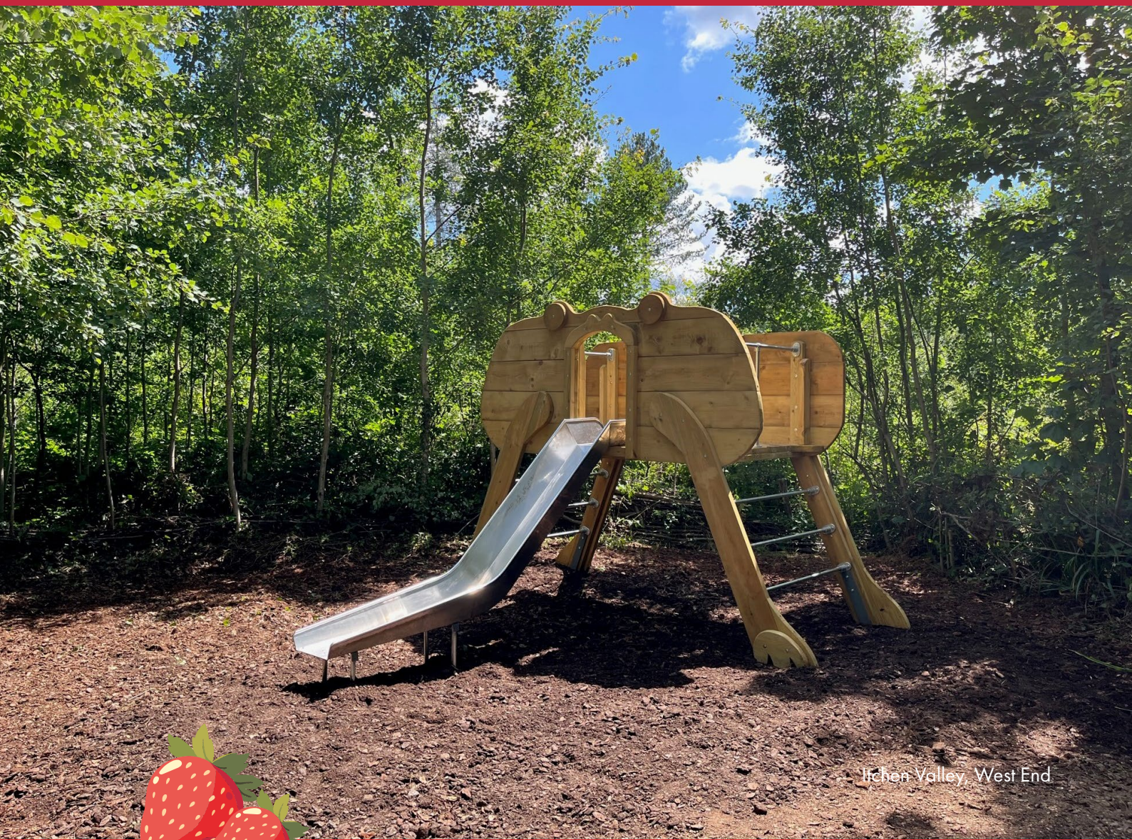
Iichen Valley, West End

The Commission is funded from a Section 106 Developer's Contribution for Public Art and funds allocated by the HEWEB Local Area Committee.