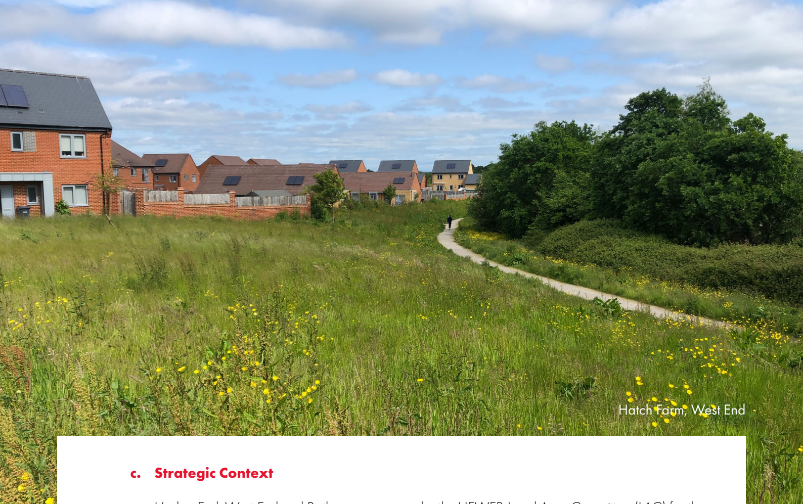
Hatch Farm, West End